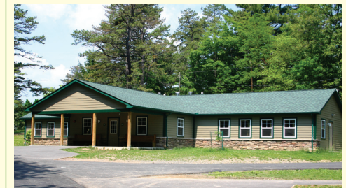
TOP: Duplex Cabins BOTTOM: Guest Lodge