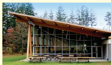
PEEC Dining Hall

PEEC staff will assist in planning and delivering programs or supplement your existing programs including: • Speakers, live animal presentations, special entertainment, recreational activities, and environmental education programs. • Advanced and on-site registration. • A PEEC Host to serve as liaison for your group during your entire program.