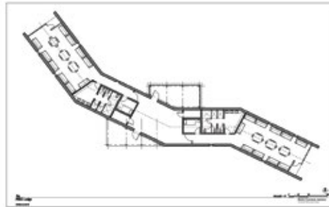
Looking to the Future - Plans have been drawn for our new Sustainability Lodge.