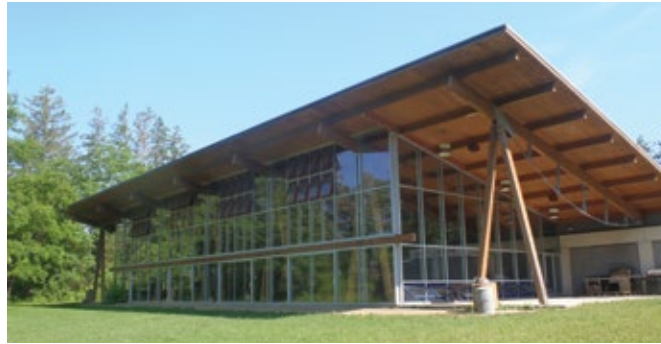
10th anniversary of PEEC's sustainable, passive solar Vistor Activity Center / Dining Hall.